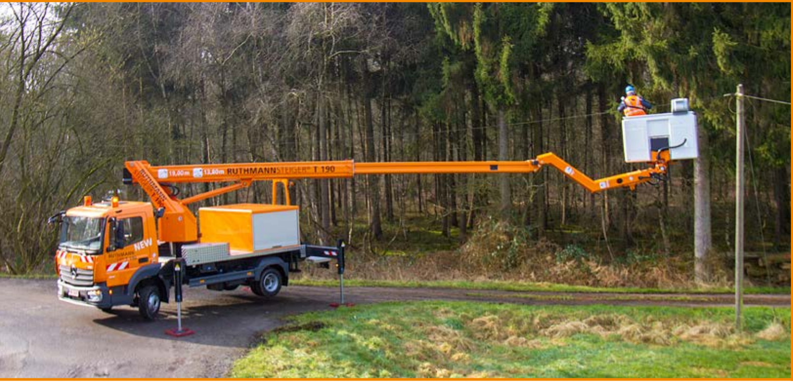
RUTHMANN STEIGER® T 190