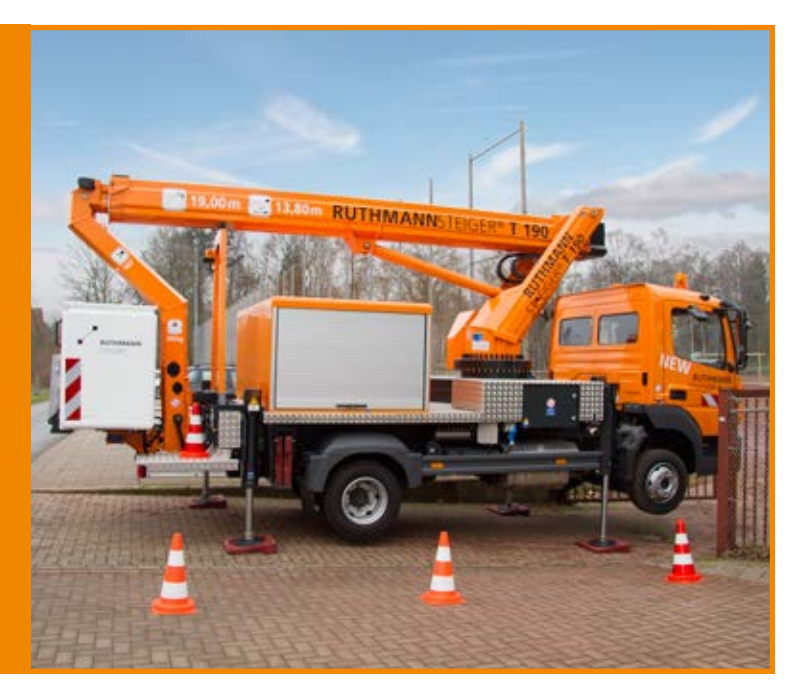
All data has been included without warranty. All measurements and weights are approximate and refer to the standard basic execution. Technical alterations reserved. STEIGER®, GELENKSTEIGER®, RÜSSEL® and CARGOLOADER® are registered trademarks of RUTHMANN GmbH & Co. KG