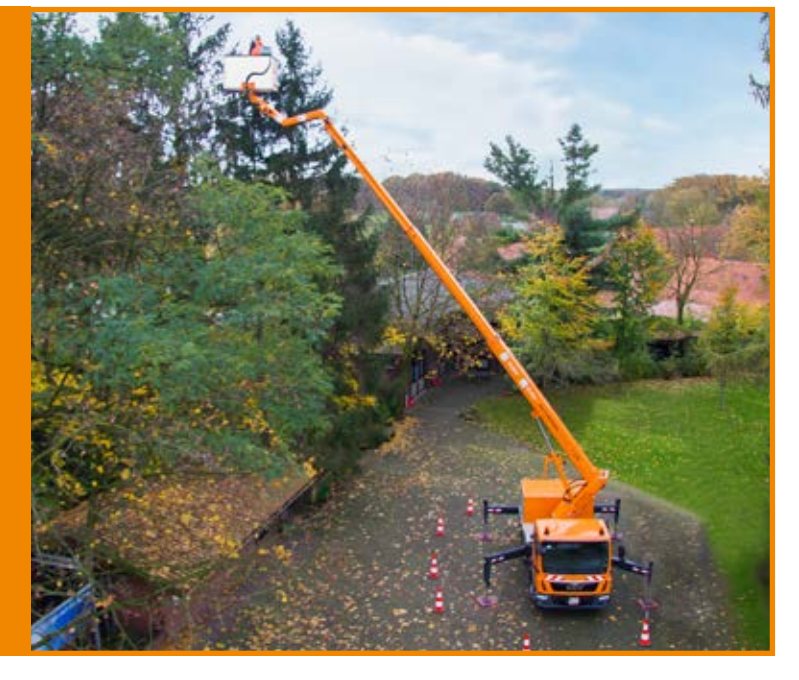
All data has been included without warranty. All measurements and weights are approximate and refer to the standard basic execution. Technical alterations reserved. STEIGER®, GELENKSTEIGER®, RÜSSEL® and CARGOLOADER® are registered trademarks of RUTHMANN GmbH & Co. KG