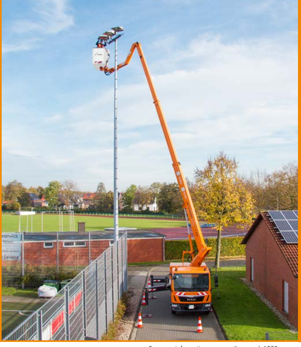
For more information: www.ruthmann.de/t230en