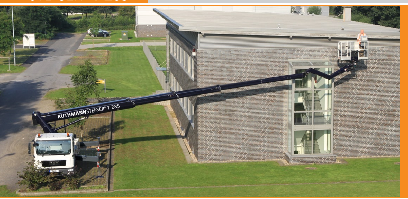
RUTHMANN STEIGER® T 285 Simply Unbeatable!